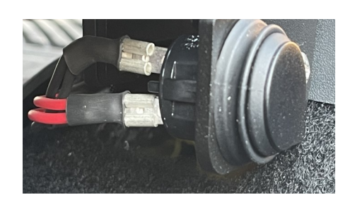
JL & JT

Thread the door delete harness with the spade connectors through the bracket. Connect each side to the door delete button and snap it into place. Red and black wires can be plugged in on either side of the button.