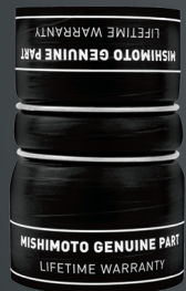
2003—2007 FORD 6.0L POWERSTROKE FACTORY-FIT HOT-SIDE LOWER BOOT MODEL: MMBK-F2D-03HL