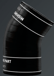
2003—2007 FORD 6.0L POWERSTROKE FACTORY-FIT HOT-SIDE UPPER BOOT MODEL: MMBK-F2D-03HU