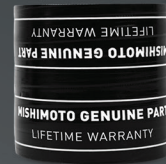
2003—2007 FORD 6.0L POWERSTROKE FACTORY-FIT COLD-SIDE UPPER BOOT MODEL: MMBK-F2D-03CU