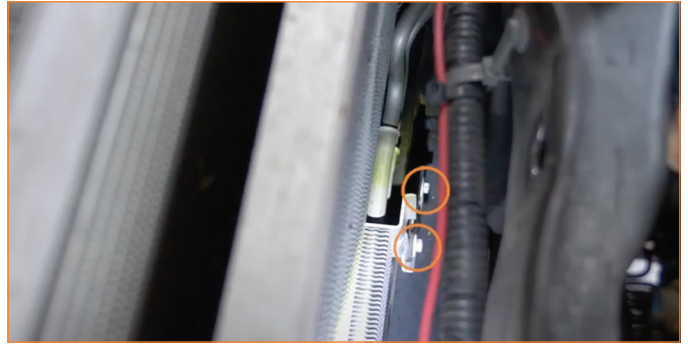
10. Remove the bolts that secure the transmission cooler. (2x 10mm bolts)