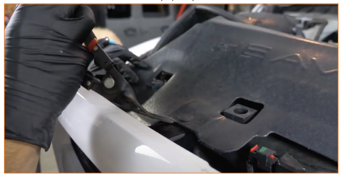
03. Remove the bolts screws that secure the grille. (4x 10mm screws)