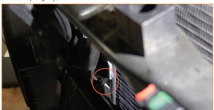
side. (1x spring clip)

16. Attach the lower line to the transmission cooler on the passenger