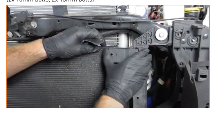
23. Reattach the shrouding on both sides of the AC condenser.(6x pop-clips)

22. Reinstall the AC condenser, including the brackets on the driver side.(2x 10mm bolts, 2x 13mm bolts)