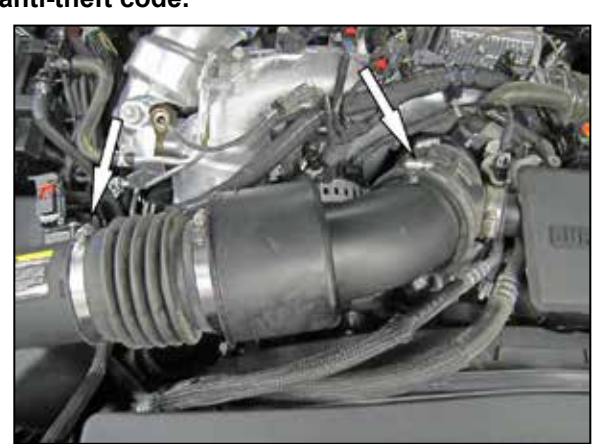
2. Loosen the two hose clamps that secure the intake tube to the air filter housing and intake plenum, then remove the intake tube from the vehicle.

NOTE: Disconnecting the negative battery cable erases pre-programmed electronic memories. Write down all memory settings before disconnecting the negative battery cable. Some radios will require an anti-theft code to be entered after the battery is reconnected. The anti-theft code is typically supplied with your owner's manual. In the event your vehicles anti-theft code cannot be recovered, contact an authorized dealership to obtain your vehicles anti-theft code.