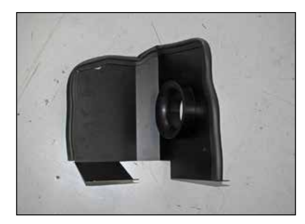
7. Install the provided edge trim onto the heat shield.