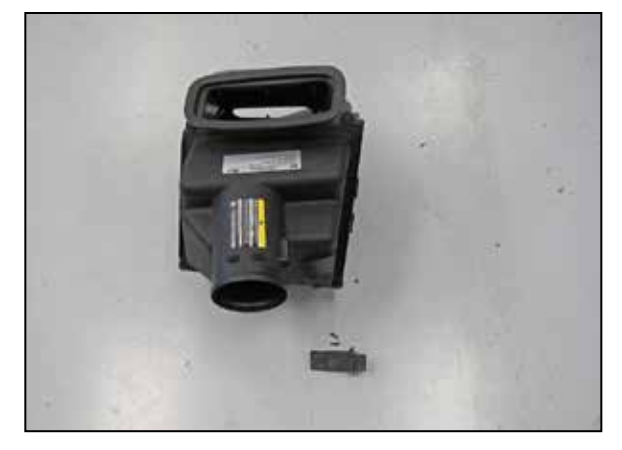
11. Remove the mass air sensor from the air filter housing.