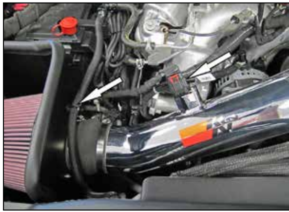
14. Reconnect the mass air sensor electrical connection and secure the coolant bypass hose to the heat shield using the factory retaining clip.