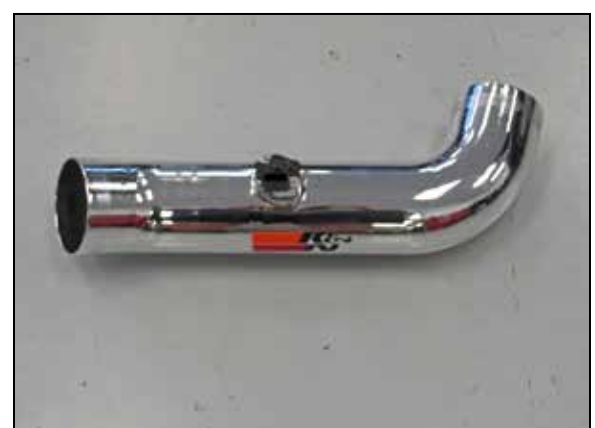
12. Install the mass air sensor into the K&N<sup>®</sup> intake tube and secure with the provided hardware.