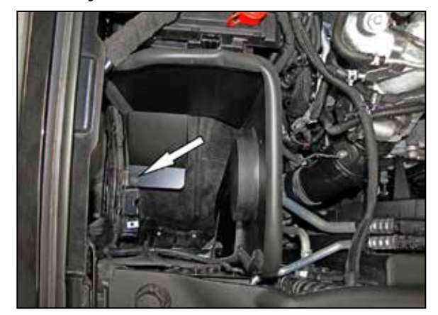
8. Install the heat shield assembly into the vehicle and secure it to the inner fender with one of the factory bolts from step #5 where shown.