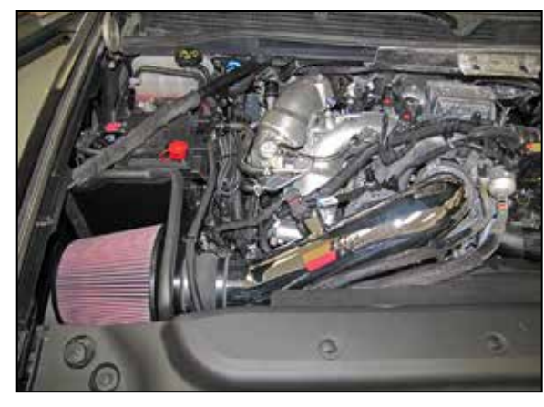
15. Reconnect the vehicle's negative battery cable. Double check to make sure everything is tight and properly positioned before starting the vehicle.

16. It will be necessary for all K&N® high flow intake systems to be checked periodically for realignment, clearance and tightening of all connections. Failure to follow the above instructions or proper maintenance may void warranty.