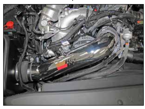
13. Install the K&N® intake tube into the coupler installed onto the filter adapter and then into the coupler installed onto the filter inlet. Adjust the tube for best fit and then secure with the provided hose clamps.