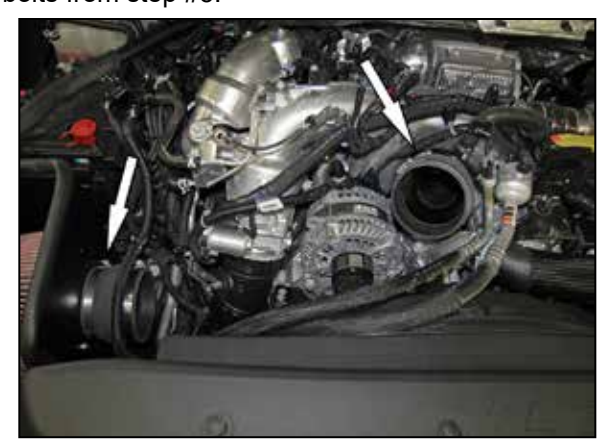
10. Install the two provided hump couplers (08418) onto the filter adapter and turbo inlet and secure with the provided hose clamps.