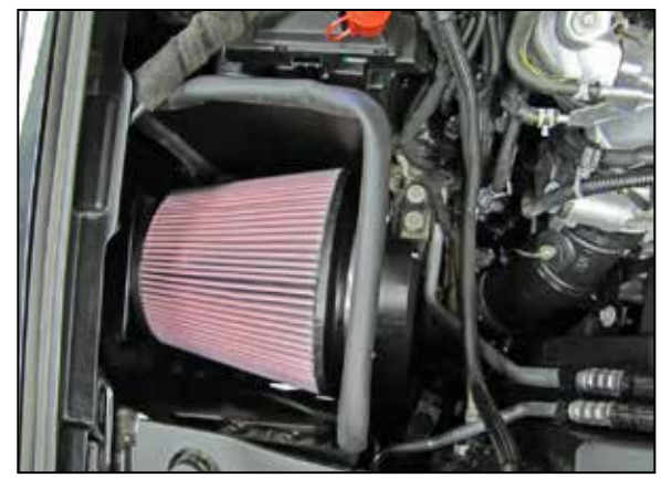
9. Flex the heat shield inward towards the engine then install the K&N® air filter onto the filter adapter and secure with the provided hose clamp. Secure the heat shield with two of the remaining factory bolts from step #5.