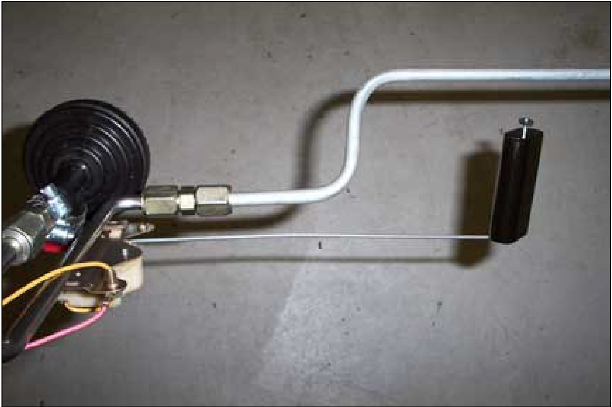
Figure 6 – Return Tube Installed