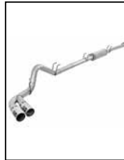
DP-Back Exhaust System

P/N: 49-43096-B (Blk. Tips) 49-43096-P (Pol. Tips)