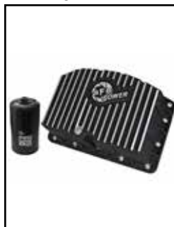
Engine Oil Pan