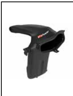
Air Intake System Scoop