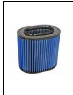
OER Air Filter

P/N: 10-10139 (P5R) 11-10139 (PDS) 71-10139 (PG7)