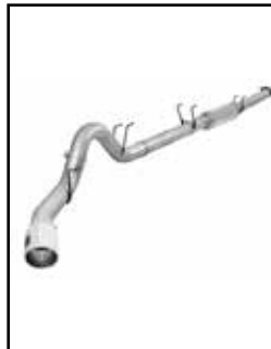
DP-Back Exhaust System

P/N: 49-43093-B (Blk. Tips) 49-43093-P (Pol. Tips)