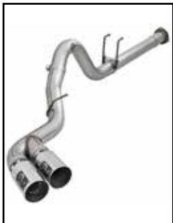
DPF-Back Exhaust System

P/N: 49-43102-B (Blk. Tips) 49-43102-P (Pol. Tips)