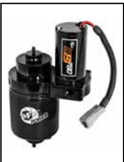
DFS780 PRO Fuel System

P/N: 49-43102-B (Blk. Tips) 49-43102-P (Pol. Tips)