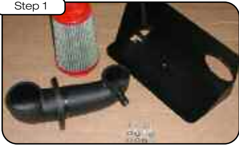
Complete kit components