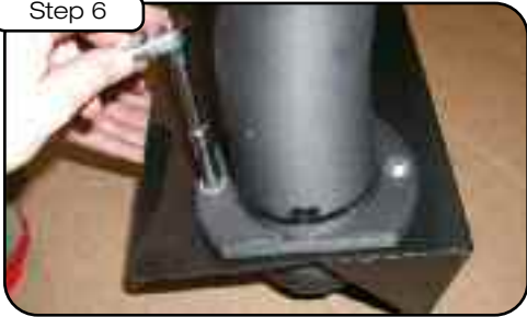
Insert tube into heat shield with flange on outside. The longer side of the tube should be facing outside of the heat shield. Secure using provided M6 hardware; be sure to use one washer for each side of each bolt, DON'T over-tighten.