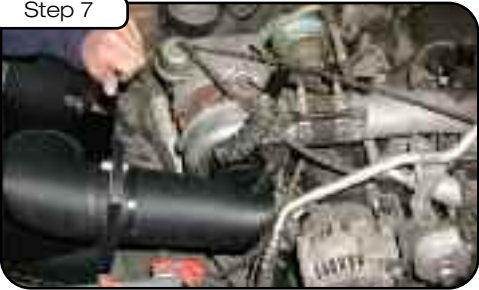
Before placing the heat shield into the engine compartment, slide the remaining clamp over the turbo coupler. Insert turbo end of the plastic tube into the coupler and rotate the assembly to seat the heat shield.