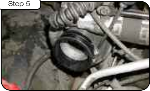
Place provided coupler onto turbo and secure the turbo end by tightening provided clamp.