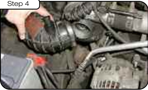
Remove factory rubber elbow at turbo.