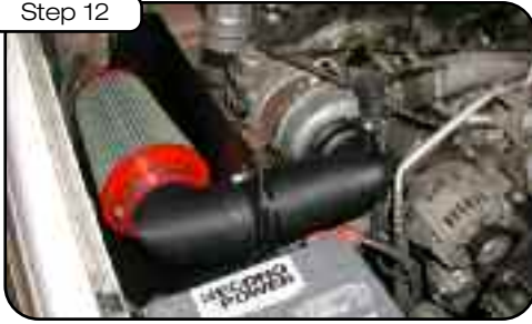
Complete aFe kit installed. Check and retighten all connections after first few hours of operation. NOTE: Place enclosed CARB EO sticker on or near the device on a smooth/clean surface. EO identification label is required to pass the smog test inspection.