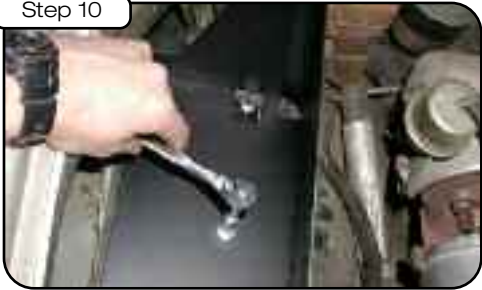
Using remaining M8 hardware and the existing holes in the fenderwell, secure the heat shield to the fender well. Tighten the hardware.