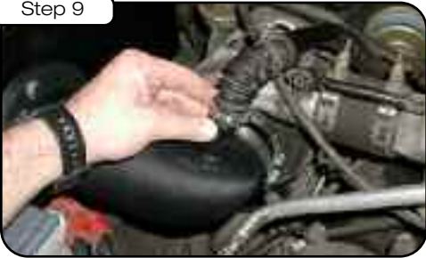
Place crankcase breather elbow onto the nipple of the plastic tube and re-tighten the coupler, be sure to not over-tighten the coupler.