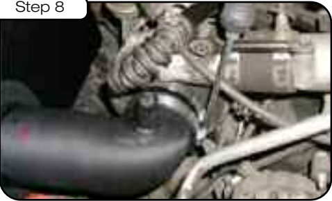
Tighten the remaining clamp securing the tube to the turbo coupler.