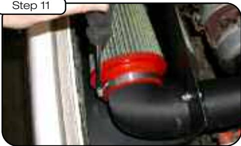
Install provided aFe filter onto the plastic tube and tighten.