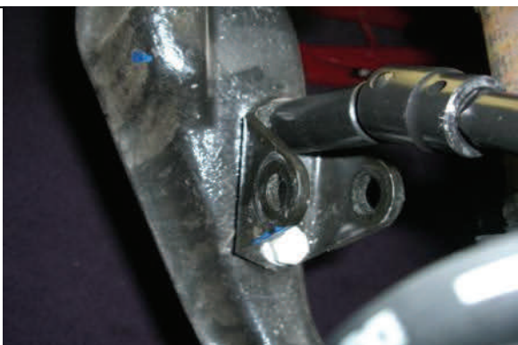
66-3050 shock extensions will replace the OE brackets