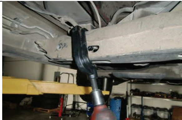
Reinstall tool and adjust upward enough to insert adj. block