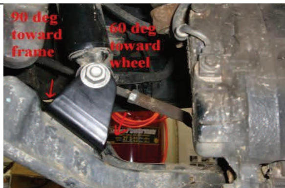
Install new extension bracket with OE bolts as shown

Reinstall wheels/tires and torque. Recheck all work performed and test drive vehicle. Note: Initial height can now be set. Final adjustments of the torsion bars may, and should be performed by the alignment shop.