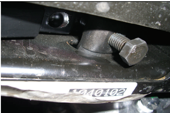
Install new adj. bolt and make bolt flush with cross-member