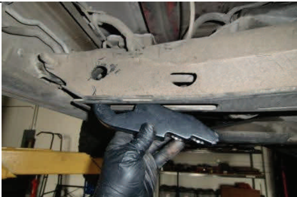
Install new ReadyLIFT forged torsion key in same position.