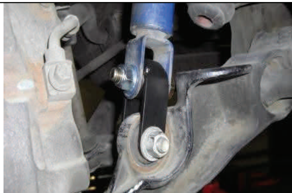
66-3000 Install front lower shock extensions and hardware