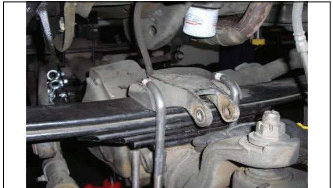
Replace spring plate with new longer U-bolts