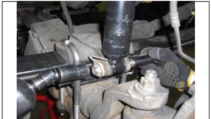
Reinstall lower shock into original position with OE hardware