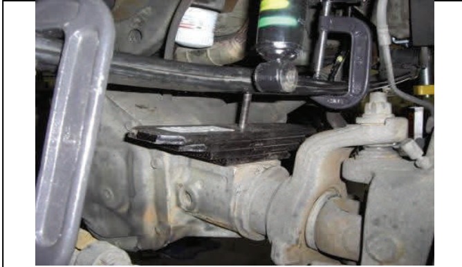
Remove nut from new center bolt and place into position