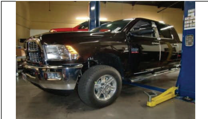
Raise and support front of vehicle on level ground.