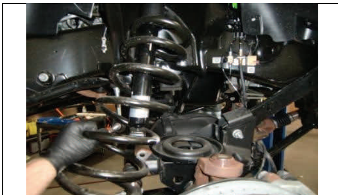
Remove spring towards the front of the vehicle.