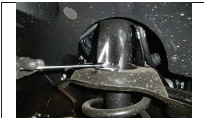
Loosen all (3) upper shock tower mounting nuts. Leave on.