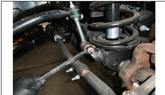
Disconnect pass/dr lower sway bar endlinks.