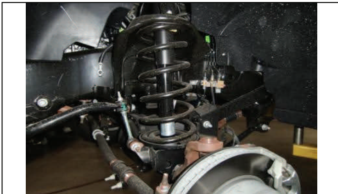
Picture of front suspension. Support front axle with jack.