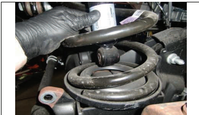
Slowly lower axle in order to remove shock and coil spring.