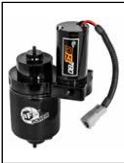
DFS PRO Fuel System