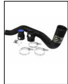
Intercooler Hot-Side Tube