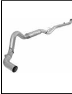
Downpipe Back Exhaust

P/N: 49-04060 (No Tip) 49-04060NM (No Muffler)