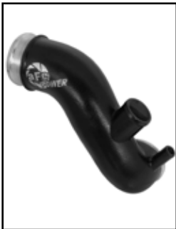
Turbo Inlet Manifold

P/N: 49-44040-B (Blk. Tip) 49-44040-P (Pol. Tip)