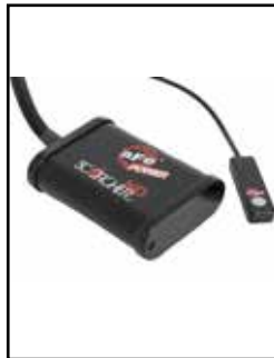
SCORCHER HD Module