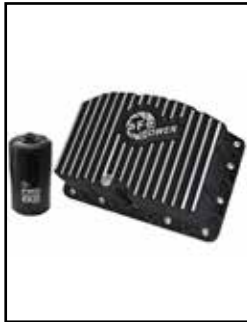
Engine Oil Pan w/ Oil Filter

P/N: 46-70322 (Blk./Mach.) 46-70320 (RAW)