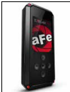
SCORCHER PRO Tune