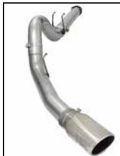
DPF-Back Exhaust System

P/N: 49-43064-P (Pol. Tip) 49-43064-B (Blk. Tip) 49-43064 (No Tip)