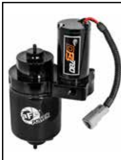
DFS780 PRO Fuel System

P/N: 46-70322 (Blk./Mach.) 46-70320 (RAW)