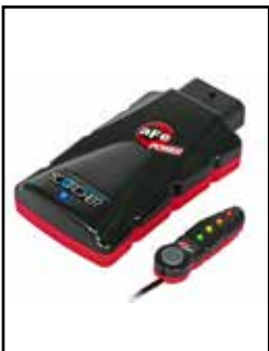
SCORCHER BLUE Module