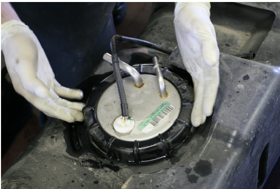
(Fig. 1) Loosen the hold-down ring on the OEM tank by turning counter-clockwise. Note where the connections on your vehicle's sending unit are “clocked” and install so they are located in the same position in the new tank.