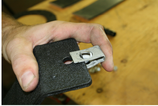
(Fig. 3) If vehicle has threaded clips, remove them from the OEM straps and place them on the TITAN straps.