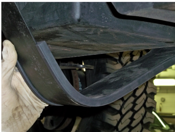
(Fig. 5) If optional TITAN Shield is not to be installed, install rubber bushings (pn 99 0000 0103) on both straps with the channel side toward the strap.