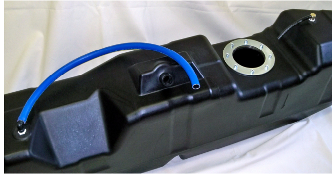
(Fig. 4) This photo shows the proper configuration of the 3/4" vent line hose. When the tank is lifted into the vehicle trim it to proper length to attach to the fill spout vent. It must be configured to angle downward from the fill spout to the tank with no sags or kinks.