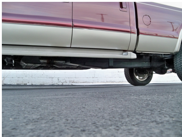
(Fig. 7) Installation complete!