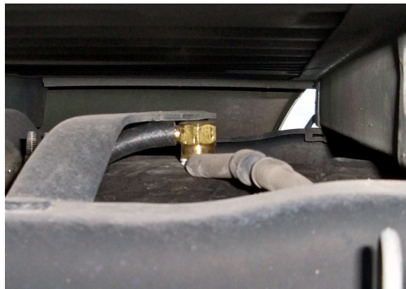
(Fig. 6) NOTE: Be sure that vent breather hose on rollover-stop vent valve, on the rear of the tank, is routed under the adjacent frame cross member as shown above.