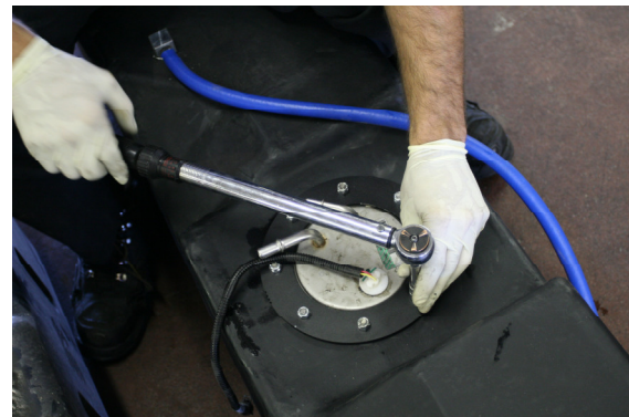
(Fig. 2) Place the sending unit into the TITAN tank, install the top flange, and tighten the nylon lock nuts to 20 ft. lbs using a “star” pattern using a torque wrench.