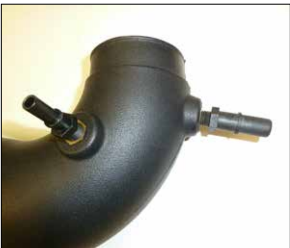
14. Install the provided quick disconnect fittings into the K&N intake tube as shown. Note: On vehicles that are only equipped with the one fitting on the side of the intake tube, install the provided pipe plug into the second position. Two different fittings are provided for the top position, be sure to install the correct fitting depending on how the vehicle is equipped from the factory. NPT fittings are easy to cross thread. Install the vent fitting “hand” tight, then turn it two complete turns with a wrench.