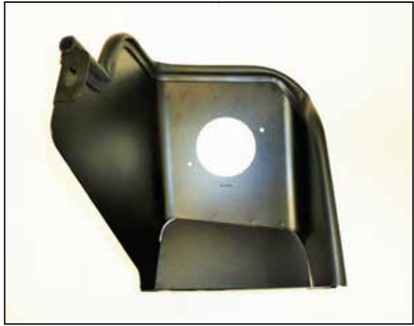
8. Install the provided edge trim onto the heat shield as shown. Some trimming of the edge trim will be necessary.