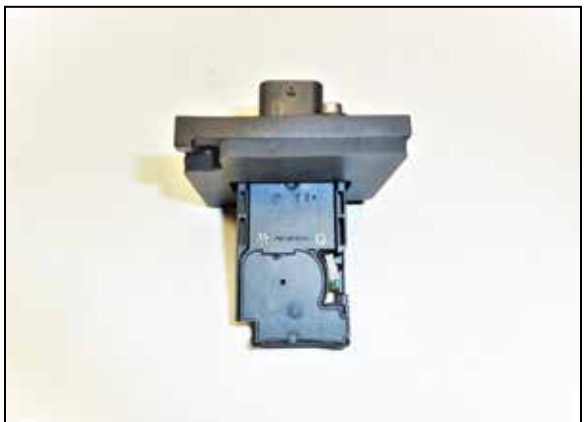
12. Install the provided gasket onto the mass air sensor adapter and then install the mass air sensor into the adapter and secure with the provided hardware.