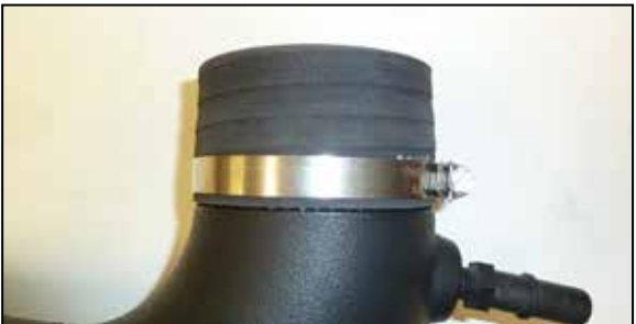
15. Install the provided straight coupler onto the K&N intake tube and secure with the provided hose clamp. NOTE: 2020-22 model years will use the straight coupler p/n 08698, 2023 and later model years will use step coupler p/n KITRDCR28.