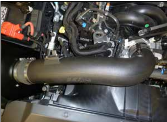
17. Install the K&N intake tube into the hump coupler and then connect to the throttle body, secure with the provided hose clamps