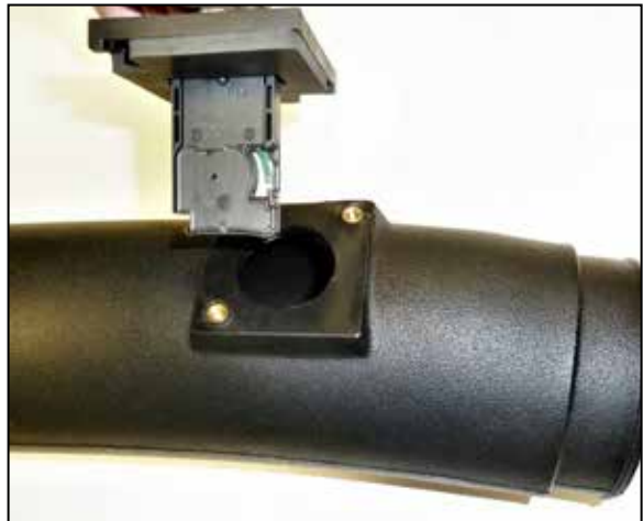
13. Install the mass air assembly into the K&N intake tube and secure with the provided hardware. NOTE: Be sure to install the sensor in the correct direction for proper operation.