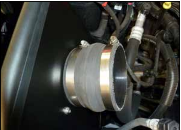
16. Install the provided hump coupler onto the filter adapter and secure with the provided hose clamp.