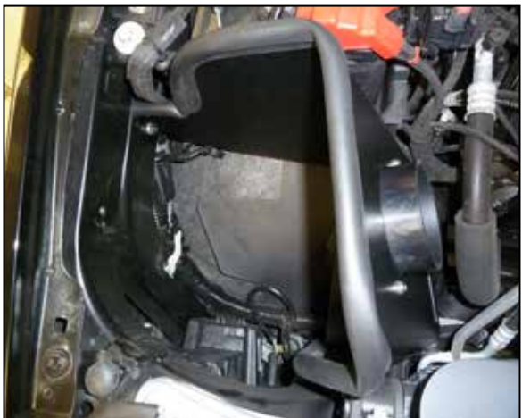
11. Install the heat shield assembly into the vehicle so the mounting post inserts into the factory mounting grommet and then secure with the provided hardware.