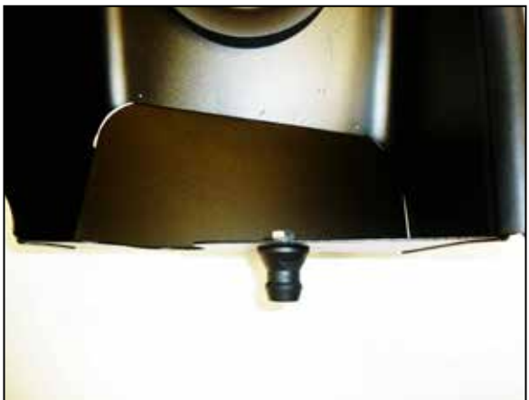
10. Install the mounting post onto the heat shield and secure with the provided hardware.