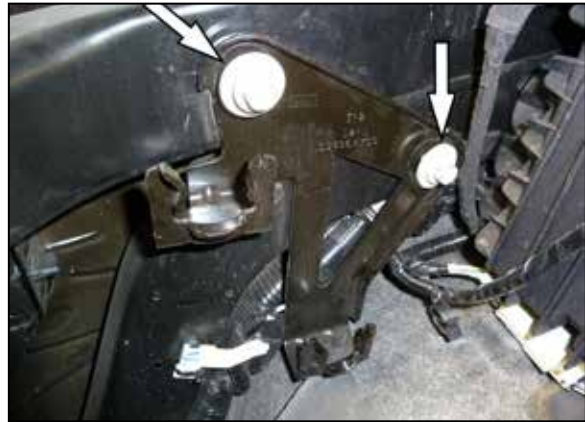
7. Remove the two bolts securing the air filter housing mounting brackets and then remove the bracket.