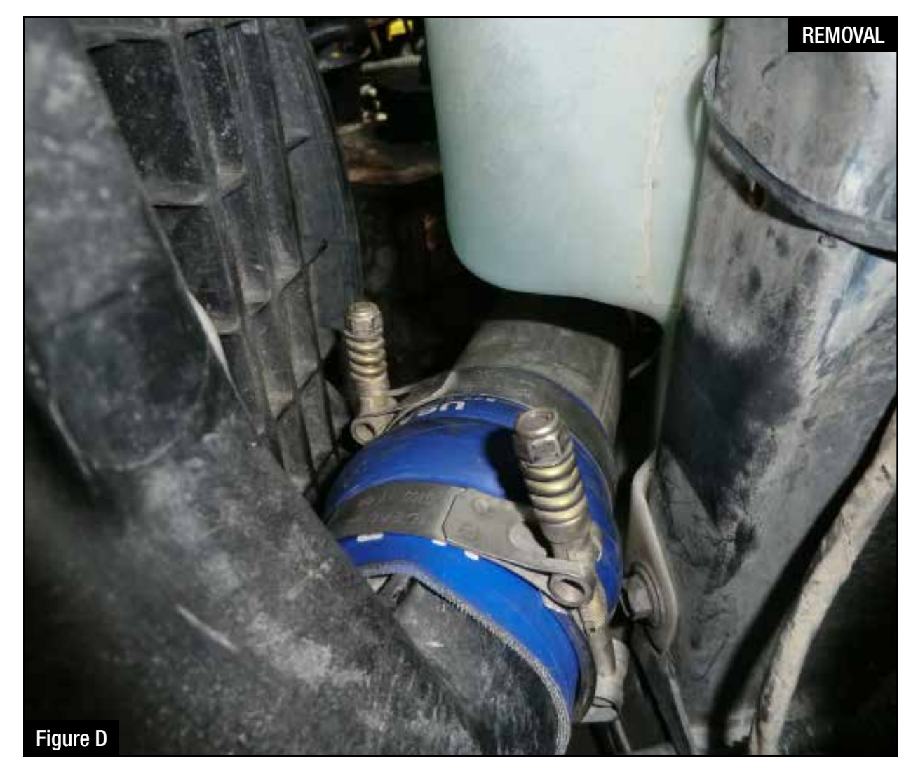
Refer to Figure D for step 9-10 (For Kit P/N: 46-11012 or 46-11013)

Step 9: Remove the clamps on the hump hose at the intercooler.