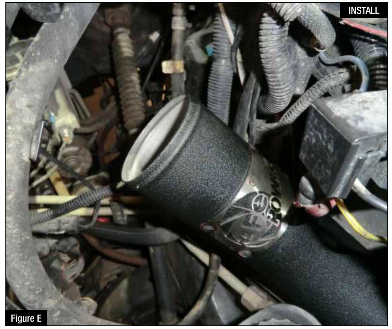
Refer to Figure E for step 11 (For Kit P/N: 46-11012 or 46-11013)

Step 11: Install the aFe boost tube in the vehicle. Insert in the hump hose at the intercooler and leave loose at this time.