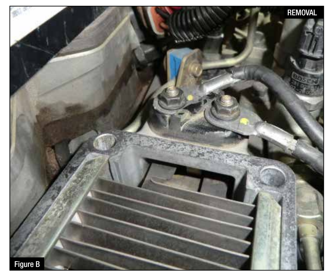
Refer to Figure B for steps 5-6

Step 5: Remove the (2) 10mm nuts from the intake heater.