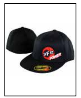
P/N: 40-10114 (S/M) P/N: 40-10115 (L/XL)