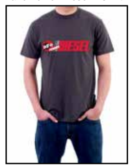
aFe Power Diesel T-Shirt

P/N: 40-30222-G (L) P/N: 40-30223-G (XL) P/N: 40-30223-G (2XL) P/N: 40-30223-G (3XL)