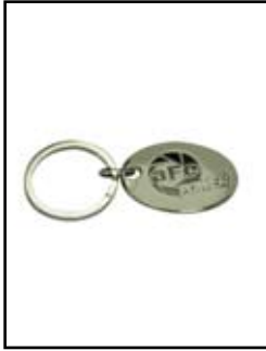
aFe Key Chain