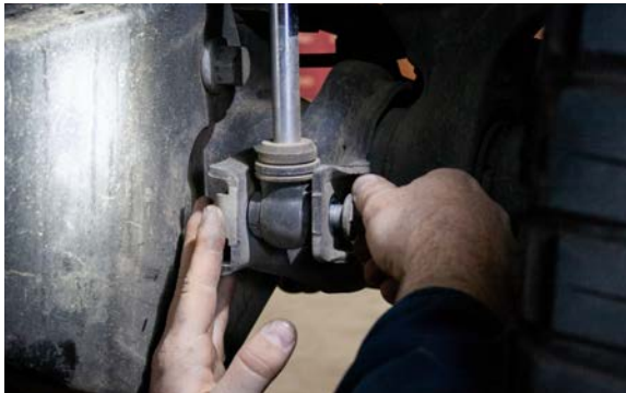
Figure 16A: Front Lower Shock Mount