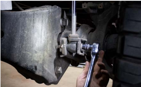
Figure 8B: Front Shock, Lower Mount