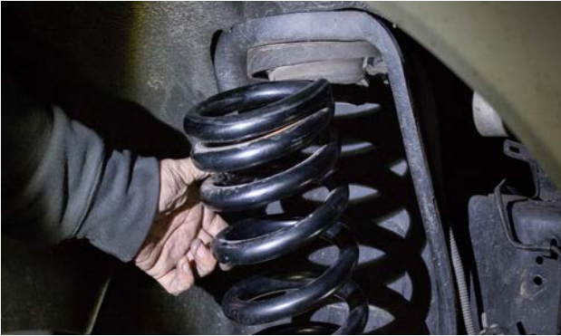
Figure 9B: Spring Removal