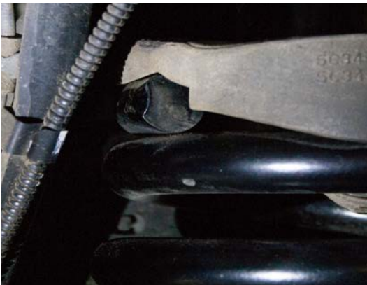
Figure 14A: Coil Spring and Isolator Orientation