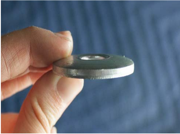
Figure 15A: Concave Shock Mounting Washer