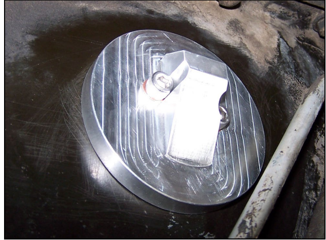
Typical OBS Adapter – Straight Up